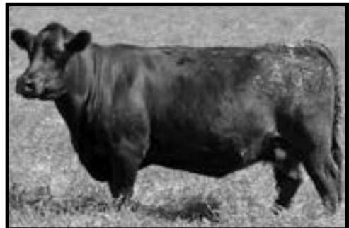
DDA Melisa E706 Full sister to E5H

BEAR OF WYE UMF 6591 DDA MELISA 545 DDA MELISA 115