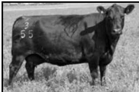
DDA Fahren 21X Daughter