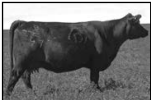
DDA Hana 879 Daughter of 0668

LEROY OF VOLGA 9874 BARBARA OF VOLGA 2094 # BARBARA OF VOLGA 9835