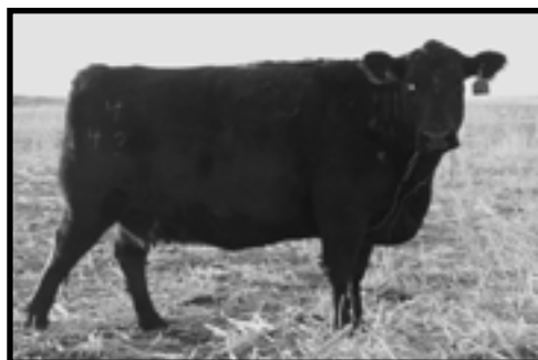
DDA Stella 443 Mother to 202

REG 14663400 OCC EMBLAZON 854E #+ DDA STELLA 216 DDA STELLA 057