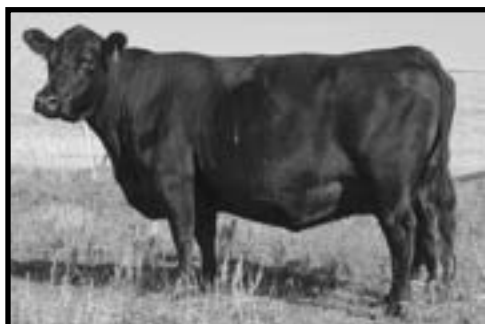
DDA Melisa 824 Mother to 27C and E5H

DDA MELISA 824 # REG 13054587 BEAR OF WYE UMF 6591 DDA MELISA 545 DDA MELISA 115